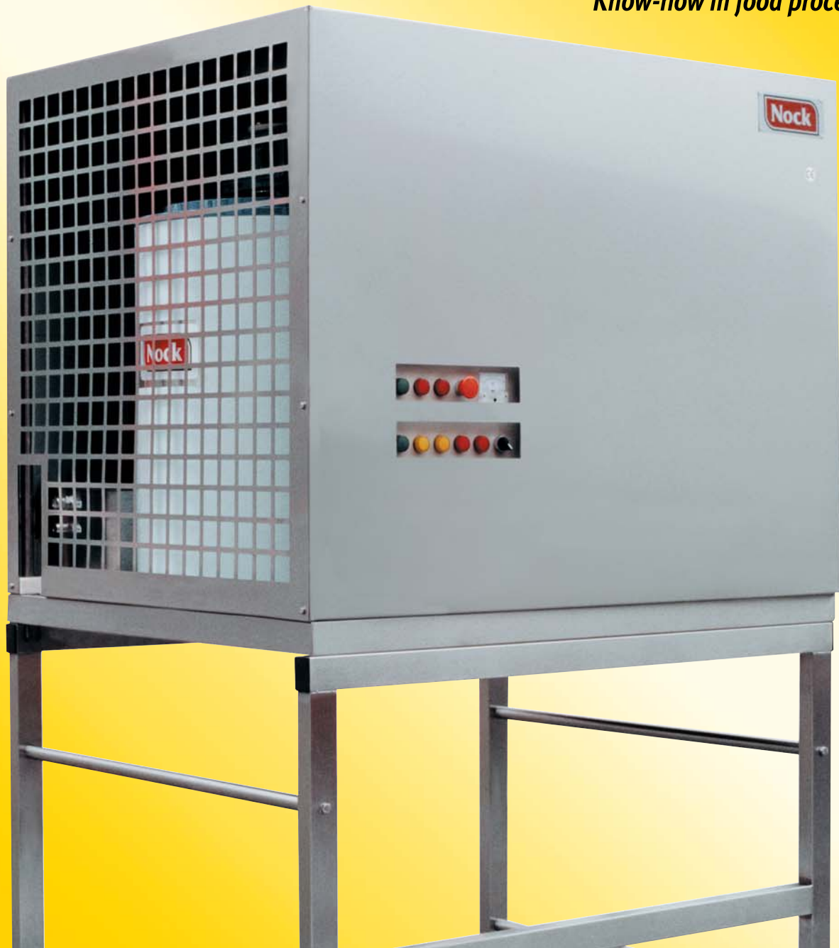
Photo: NOCK ECONOMY SE 1500 with stainless steel housing and optional under frame